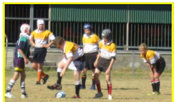
Our Boys' Open Team give it their best shot against Glen Innes at Rugby League Park.