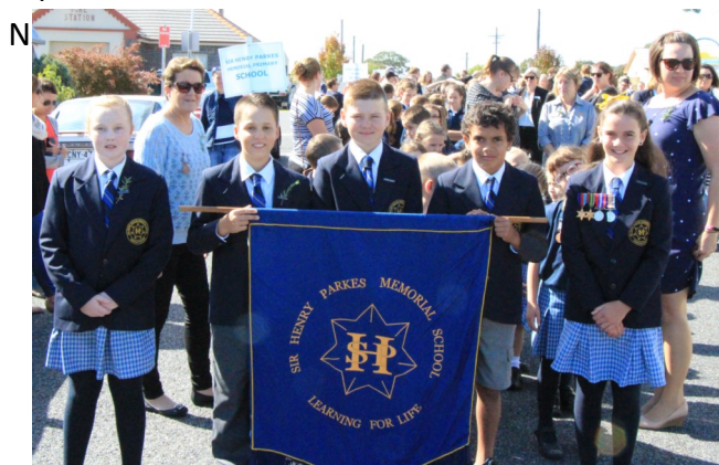
The Sir Henry Parkes Memorial Public School proudly stands on Yakambul land

Well done to those students and families who were able to attend yesterday's march. I received many compliments from community members about how fantastic our school looked and their excellent representation of our school and Public Education N