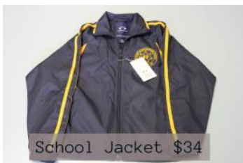
School Jacket $34

I informed parents earlier this year that the school polo shirts at 'Seamlines' were incorrectly made. The panel at the front under the buttons should be white, not navy.