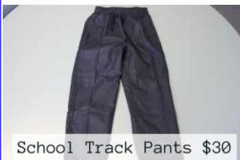
School Track Pants $30

After these are all gone the only uniforms we will stock are the sports tracksuits.