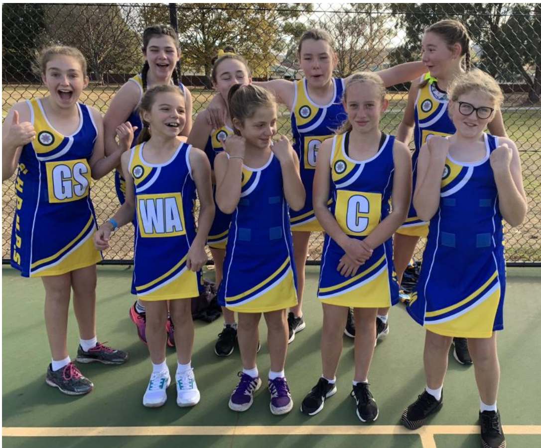
The Sir Henry Parkes Memorial Public School proudly stands on Yakambul land