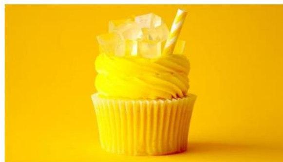
Cancer Research Fundraiser Day

Please feel free to drop off any home bake to our canteen, all is appreciated and is a big help.