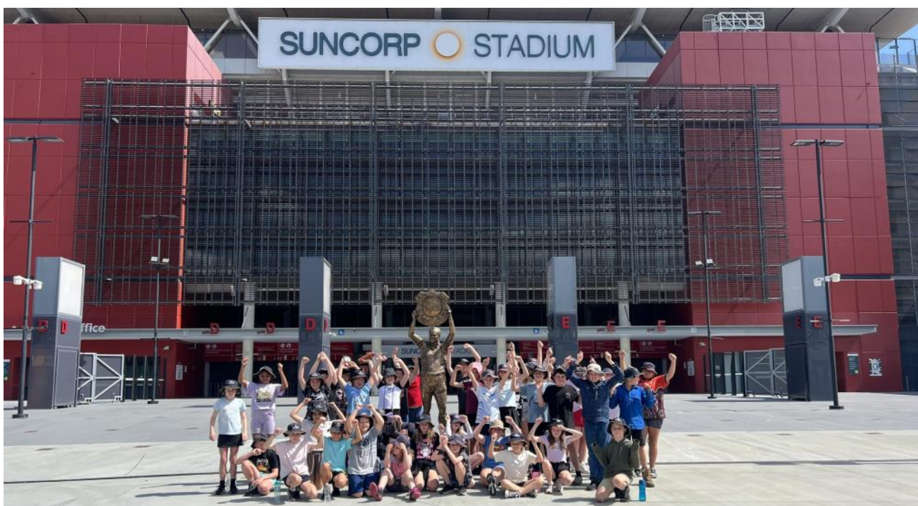
The Sir Henry Parkes Memorial Public School proudly stands on Yakambul land

The survey is open for parents to complete until November 8—THIS FRIDAY